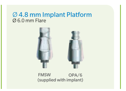
Straight Abutment (w/transfer/waxing coping) and Replica (sold separately)