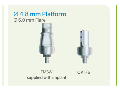
Direct Transfer (optional procedure for Open Tray Impressions, Transfer supplied with Implant, screw sold separately)